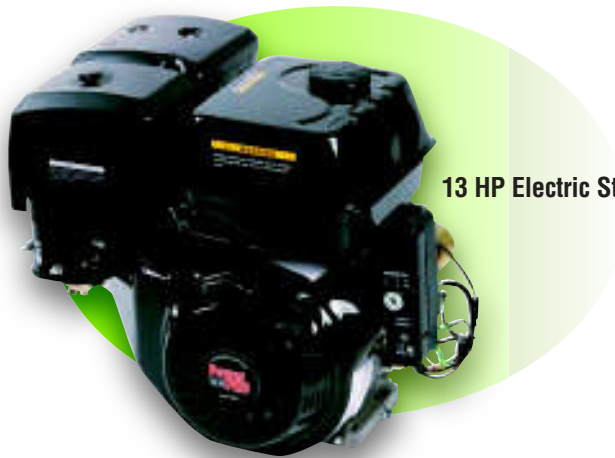
13 HP Electric Start